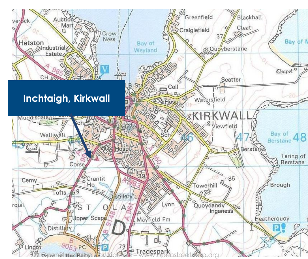
This map is made available under the Open Database Licence

NOTES - These particulars have been prepared following inspection of the property in April 2024 and from information furnished by the sellers on that date. These particulars do not form part of any offer or contract. All descriptive text and measurements are believed to be correct but are not guaranteed or warranted in any way, nor will they give rise to an action in law. Any intending purchaser are recommended to view the property personally and must satisfy themselves as to the accuracy of the particulars. Interested parties should note their interest with the selling agents. However, the seller retains the right to accept an offer at any time without setting a closing date. We accept no responsibility for any expenses incurred by intending purchasers in inspecting properties.