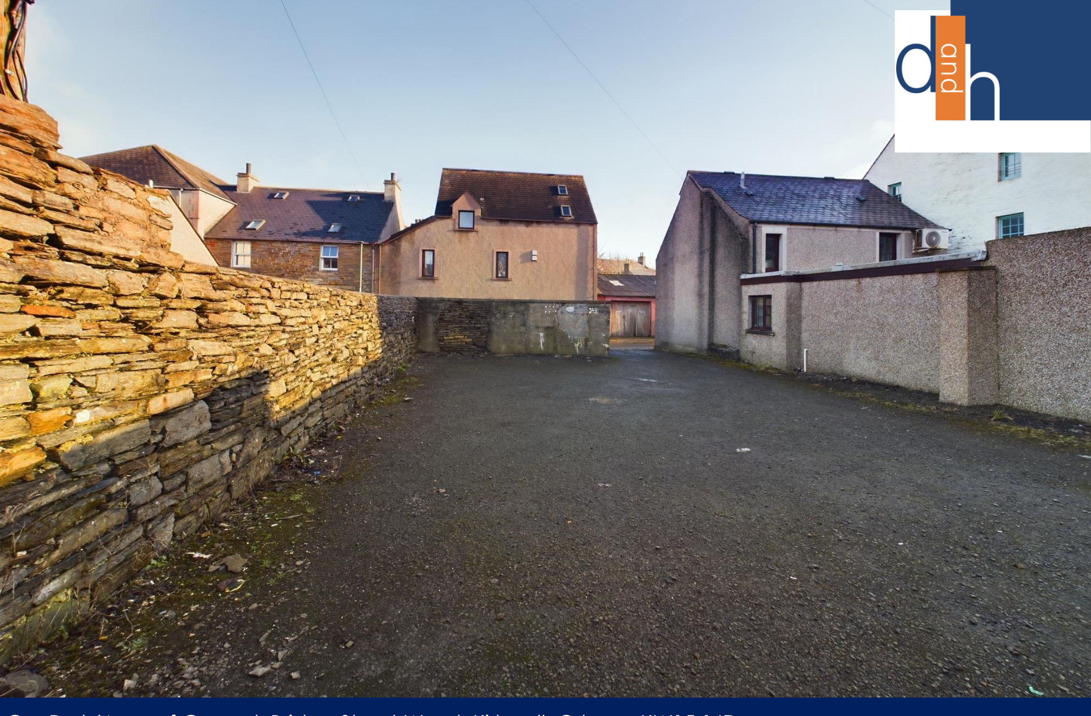
Car Park/Area of Ground, Bridge Street Wynd, Kirkwall, Orkney, KW15 1JD FOR SALE – Offers over £95,000