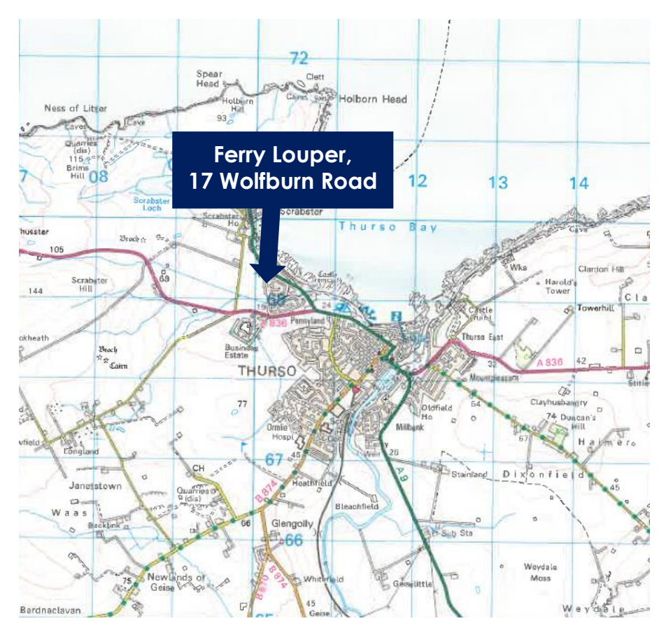
© OpenStreetMap contributors – www.openstreetmap.org This map is made available under the Open Database Licence

*All viewings are conducted at the viewers own risk.